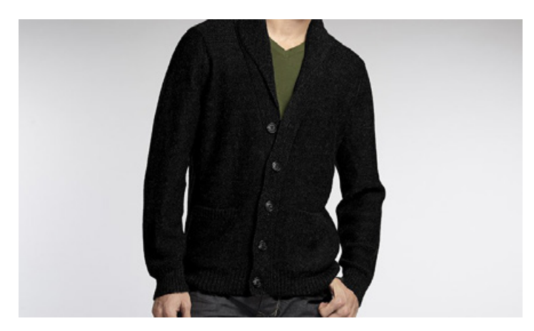
Indigenous™ Men's Alpaca Shawl Collar Cardigan Indigenous™ Men's Alpaca Shawl Collar Cardigan is made by fair trade artisans in Peru.