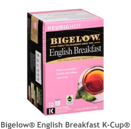
The Bigelow® English Breakfast K-Cup® is Fair Trade Certified™, meaning ingredients are sourced

other tea from Equal Exchange® are fair trade and come from farms where there is no forced labor.