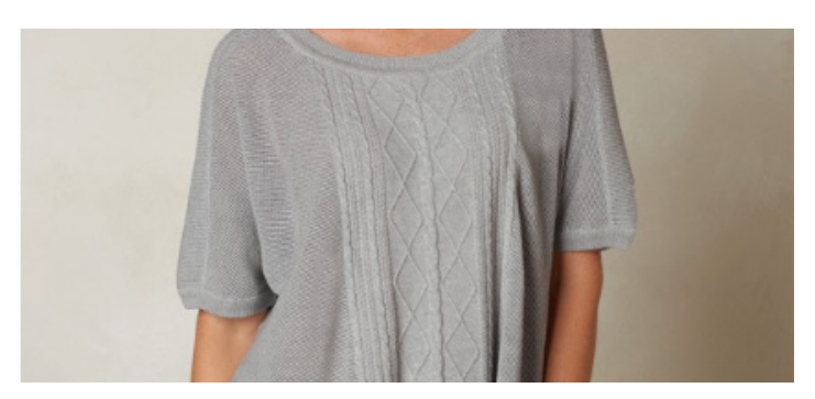
prAna® Nadine Sweater The 100% organic cotton prAna Nadine Sweater is Fair Trade Certified™ and supports better working conditions for factory workers.