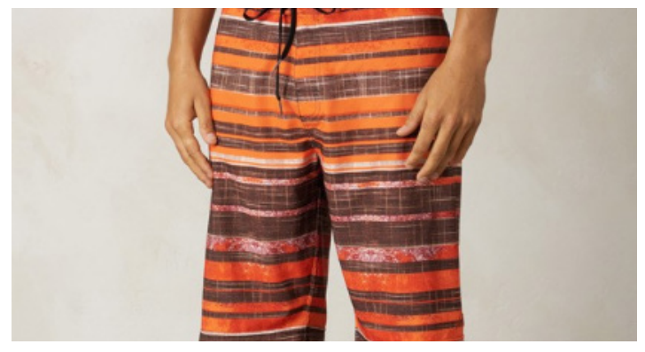
prAna® Sediment Short While not specifically fair trade, the prAna® Sediment Short is using a variety of other sustainable practices, and prAna® continues its commitment to add more fair trade goods.