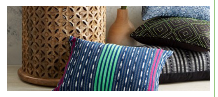
Macy's® Gifts that Give Hope - Pillows Part of Macy's® Gifts that Give Hope program features pillows from Heart of Haiti and baskets from Rwanda. These pillows and baskets are artisan made.

The Brilliance Candle is made by adult, female artisans who are paid fairly and respected at their workplace. Prosperity Candle<sup>SM</sup> is certified by the B Lab and a part of the World Fair Trade Organization.