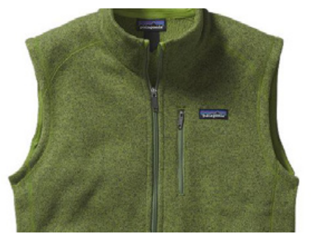
Patagonia® Men's Better Sweater® Fleece Vest Patagonia® Men's Better Sweater® Fleece Vest is made using bluesign® approved fabric and Fair Trade Certified™ sewing.