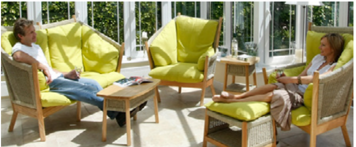
The Fair Trade Furniture Company Semarang Chair By purchasing the Semarang Chair from The Fair Trade Furniture Company, you are supporting the ability of slavery-free suppliers to continue supporting the craft of adult artisans.