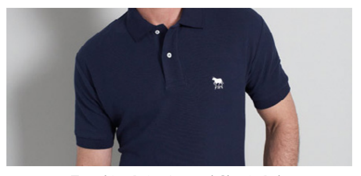
Tompkins Point Apparel Classic Polo This Fair Trade Certified™ and organic Tompkins Point Apparel Classic Polo was ethically produced in Calcutta, India from 100% Indian cotton purchased from farmerowned trading companies.