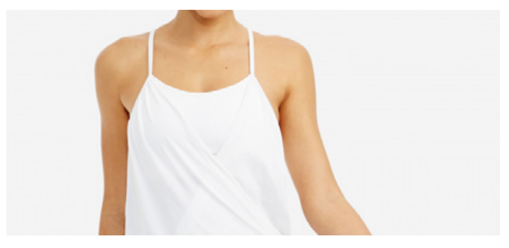
YOGASMOGA® Tickle Me Tank The YOGASMOGA® Tickle Me Tank is made with breathable and light mesh fabric manufactured in the U.S.