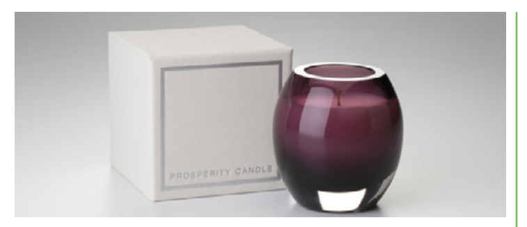
Prosperity Candle<sup>SM</sup> Brilliance Candle

The Brilliance Candle is made by adult, female artisans who are paid fairly and respected at their workplace. Prosperity Candle<sup>SM</sup> is certified by the B Lab and a part of the World Fair Trade Organization.