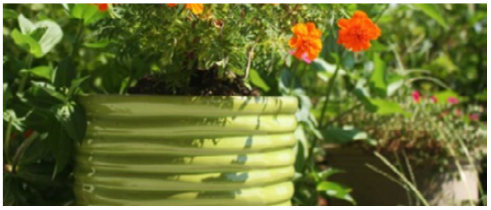
Ten Thousand Villages® Green Hills Planter The Green Hills Planter is a handcrafted ceramic pot from Vietnam. Like all the other fair trade items from Ten Thousand Villages®, this product was made without forced or child labor.