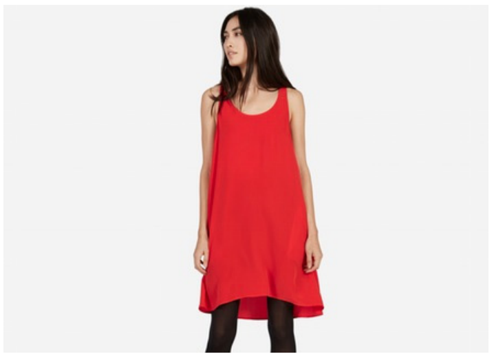
Everlane® Silk Tank Dress This Everlane® Silk Tank Dress is made in Hangzhou, China in a factory regularly visited by the Everlane® team.