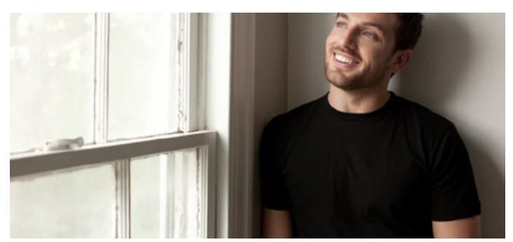
Good & Fair™ Men's Crew Neck Tee Good & Fair™ Men's Crew Neck Tee is Fair Trade Certified™ and a slavery-free wardrope staple.