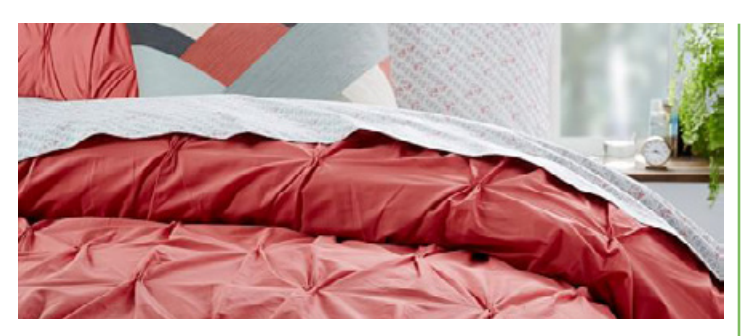
west elm™ Organic Cotton Pintuck Duvet Cover This duvet cover and bedding set is fair trade and comes from west elm™, a company that works closely with Fair Trade USA<sup>SM</sup>. Search their site for other certified lines.