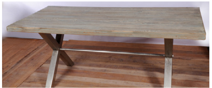
Worldstock Fair Trade® Dining Table Worldstock Fair Trade® is a store within Overstock.com® that features fair trade, handmade items from artisans around the globe.