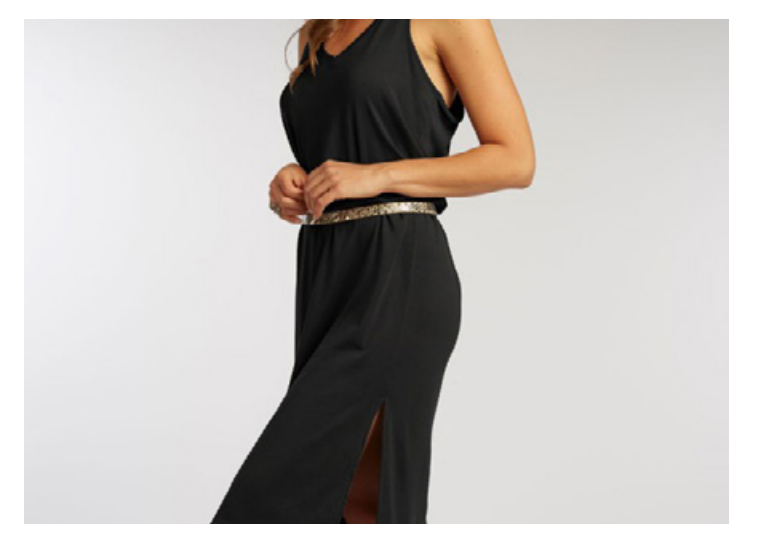
Indigenous™ Essential Tank Dress Made by fair trade artisans in Peru, the Indigenous™ Essential Tank Dress is made by fairly paid workers.