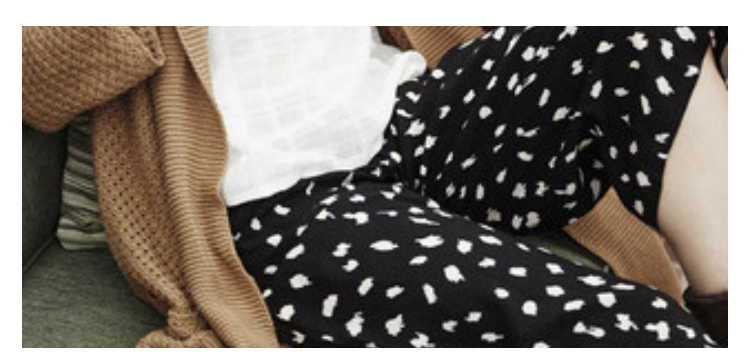
Karuna Capri PUNJAMMIES® Lounge Pants These Karuna Capri PUNJAMMIES® Lounge Pants are made by women in India who have escaped human trafficking.