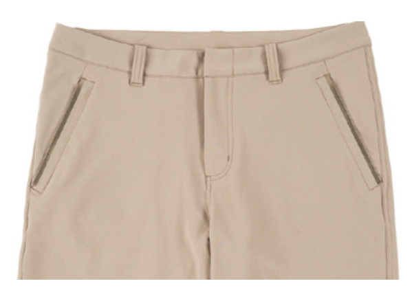
Cotopaxi® Samburu Shorts The Cotopaxi® Samburu Shorts are made in Portland, Oregon and are free from slave labor.