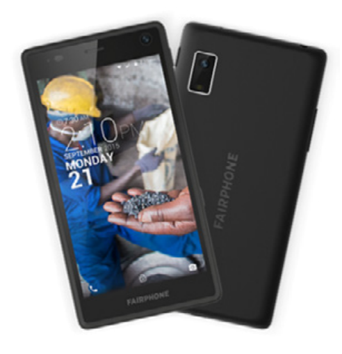
Fairphone® 2 While not fair trade certified, Fairphone® 2 is the best example in the electronics sector of a product produced with fair trade and conflict-free standards in mind.