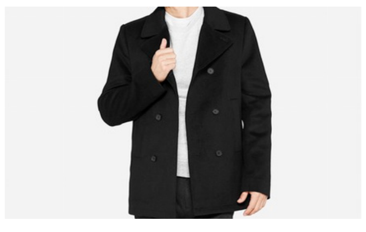
Everlane® Quilted Peacoat The Everlane® Quilted Peacoat is produced by a factory in Suzhou, China that respects workers' rights.