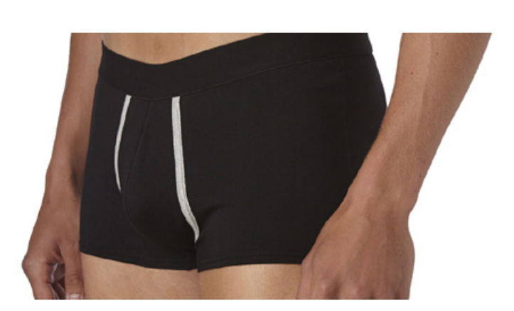
PACT® Men's Organic Trunk PACT® Men's Organic Trunk is made with Fair Trade Certified™ cotton.