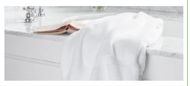
Boll & Branch™ Towels Towels and sheet sets from Boll & Branch™ are from Fair Trade Certified™ factories and farms, meaning that these goods are free of child and forced labor.