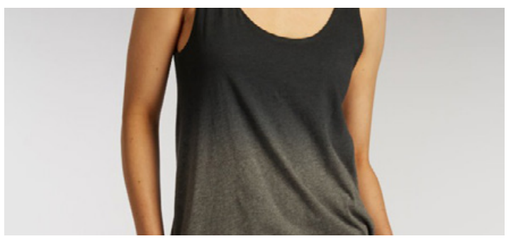
Indigenous™ Hand Dipped Tank Made by fair trade artisans in Peru, this organic cotton Indigenous™ Hand Dipped Tank is free from slave labor.