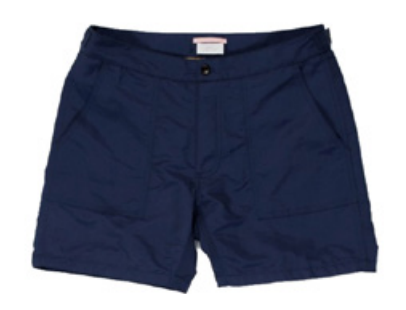
Apolis® Transition Scout Short This Apolis® Transition Scout Short is made by fairly paid adult workers.

We recommend the following products as slavery-free options.