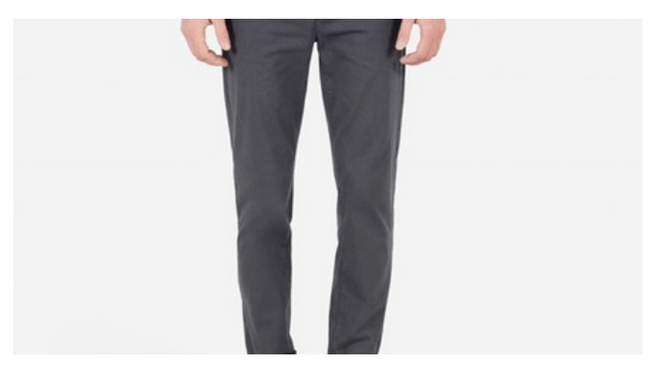
Everlane® Slim Pant The Everlane® Slim Pant is made in a Dongguan, China factory regularly visited by the Everlane® team.