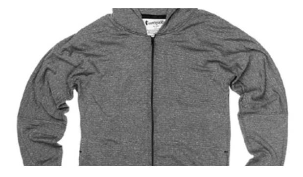
Cotopaxi® Toliman Wool Hoodie This Cotopaxi® Toliman Full-Zip Wool Hoodie Made is made by fairly paid workers in Portland, Oregon.