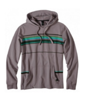
prAna® Setu Hoodie Most of prAna®'s products, such as this Setu Hoodie, are Fair Trade Certified™ to indicate fair wage payments and decent working standards.