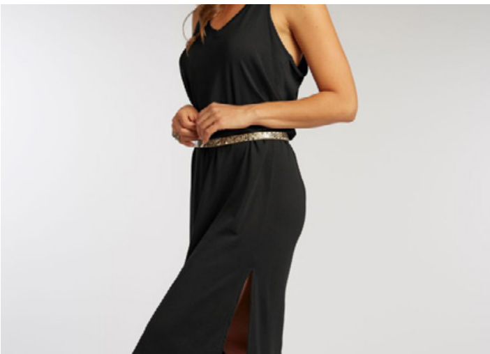
Indigenous™ Essential Tank Dress Made by fair trade artisans in Peru, the Indigenous™ Essential Tank Dress is made by fairly paid workers.