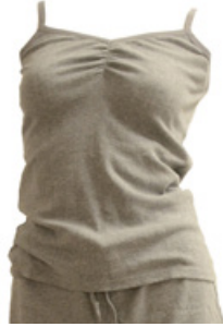
PACT™ Super Soft Organic Women's PJ Set This pajama set is made with organic and Fair Trade Certified™ cotton to ensure a soft, comfortable, and ethical product.