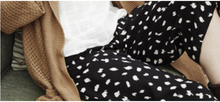
Karuna Capri PUNJAMMIES® Lounge Pants These Karuna Capri PUNJAMMIES® Lounge Pants are made by women in India who have escaped human trafficking.