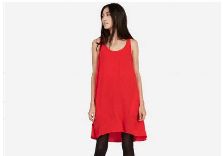
Everlane® Silk Tank Dress This Everlane® Silk Tank Dress is made in Hangzhou, China in a factory regularly visited by the Everlane® team.